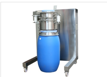
Flexisieve 350 & Magnetic Separator on trolley