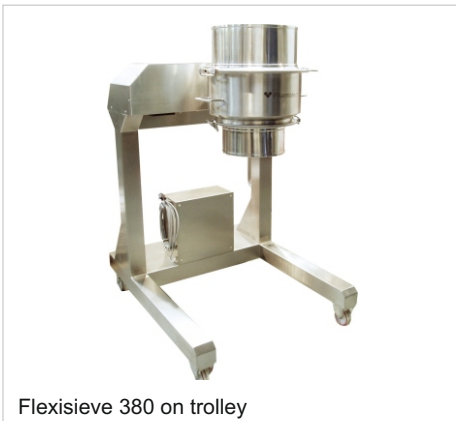
Flexisieve 380 on trolley